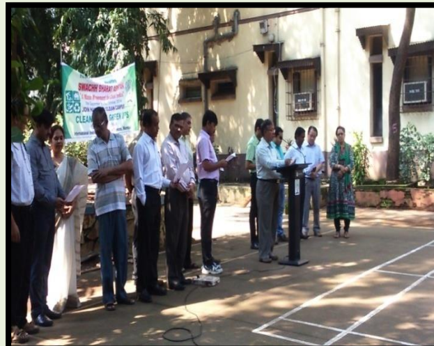
Welcome Speech by Director, IIPS

Cleanliness activities were done in our Institute from 10.30am - 5.00pm on 02 nd October, 2014. During that time, Institute grounds, area nearby academic building and offices, IIPS-Lakhme Private road, old canteen, old and new hostel area were cleaned. We sprinkled bleaching powder, phenyl in those areas to get rid of smell and mosquitoes. Tree leaves, branches, residue were collected and dumped in the dumping area away from residential area and hostel.