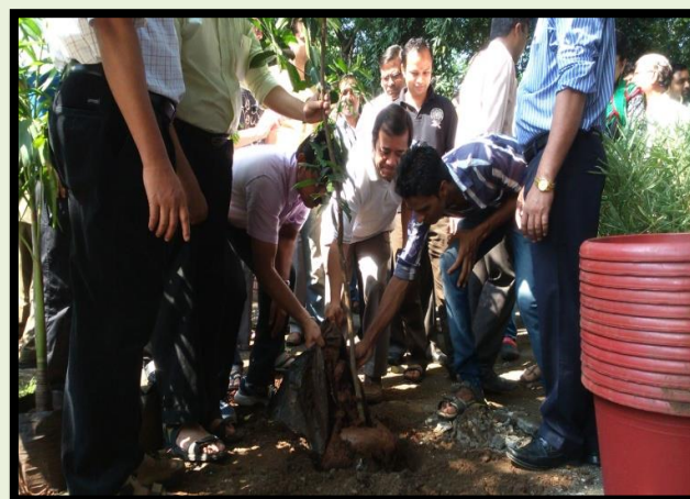
Swachh Bharat Abhiyaan, IIPS- Mumbai: Oct- Dec, 2014