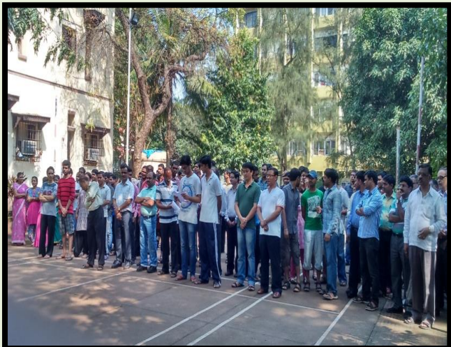
Gathering for Cleanliness activity

The activity was started by the Director, IIPS on the occasion of Mahatma Gandhi's Birthday i.e. 02 nd October, 2014 at 10.00 AM by taking an oath to keep our surrounding neat and clean and help India to be clean. All the students, faculties and administrative staffs were gathered in the ground and took oath.