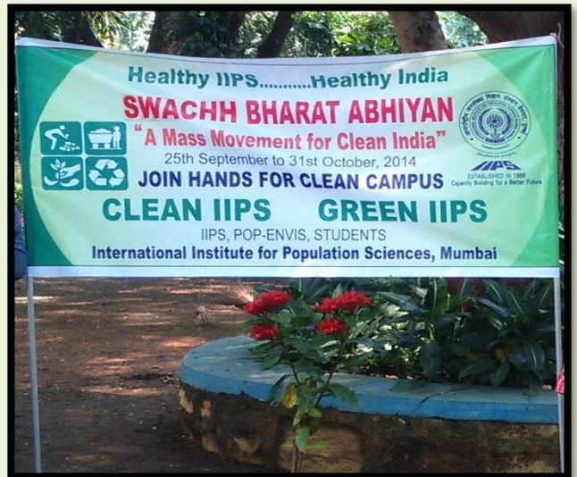
Swachh Bharat Abhiyaan, IIPS- Mumbai: Oct- Dec, 2014