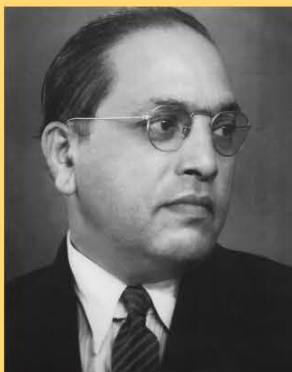
Bharat Ratna Dr. Bhimrao Ramji Ambedkar (1891-1956)

Babasaheb, as he is fondly known, was born on the 14th of April, 1891. He was a philosopher, economist, legal luminary, and a social revolutionary with an uncompromising commitment to protecting the human rights of millions of Indians. He has left an indelible mark on the Indian society, polity, and economy with his countless scholarly writings, pragmatic policies and strategies, and everlasting statesmanship. Of all, he was the main architect of the Constitution of India. When higher education was difficult to attain even for the most affluent class in India, Dr. Ambedkar reached New York, USA, in 1913 and secured an M.A. in Political Science with economics as a major subject and, subsequently, a Ph.D. in economics. He secured yet another Master's and a Doctorate from the London School of Economics in economics and, simultaneously, a law degree from The Honourable Society of Gray's Inn, London. Although Ambedkar was an indispensable choice for drafting the Indian Constitution due to his scholarship on constitution-making and his multiple doctorates from world-renowned universities, his voluminous writings, and speeches in diverse fields are hardly known, even among academicians.