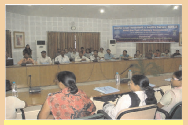
Training session in progress at Jaipur for pre-test

International Institute for Population Sciences has been designated as the national nodal agency to conduct the District Level Household and Facility Survey (DLHS-4) by the Ministry of Health and Family Welfare, Government of India. DLHS-4, in addition to household and facility survey, has two new components- information on Causes of Death and Clinical, Anthropometric and Biometric (CAB) aspects. The household and facility survey would be implemented in 26 states and union territories. The facility survey will be undertaken in nine states of Uttar Pradesh, Uttarakhand, Madhya Pradesh, Chhattisgarh, Bihar, Jharkhand, Odisha, Rajasthan and Assam where the household survey is covered under the Annual Health Survey (AHS).