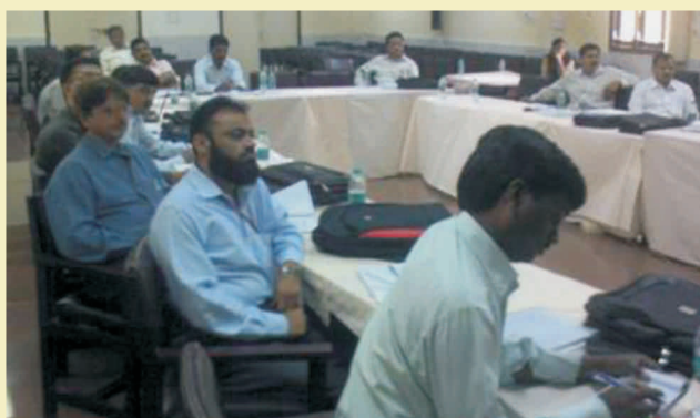
Participants of the training programme

Level Managers in Evidence Based Planning and Monitoring of Health Programmes' at Hotel Rama International, Aurangabad during 21-23 October and 26-28 October 2010.