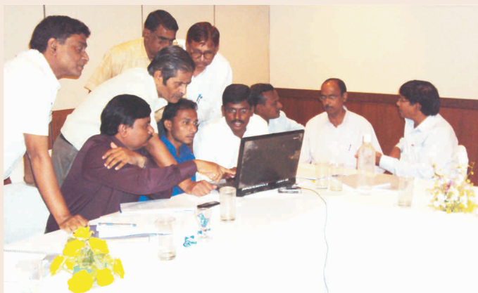
Participants of the training programme

Health Programmes" at the institute during 11-13 November, 18-20 November and 24-26 November 2010.