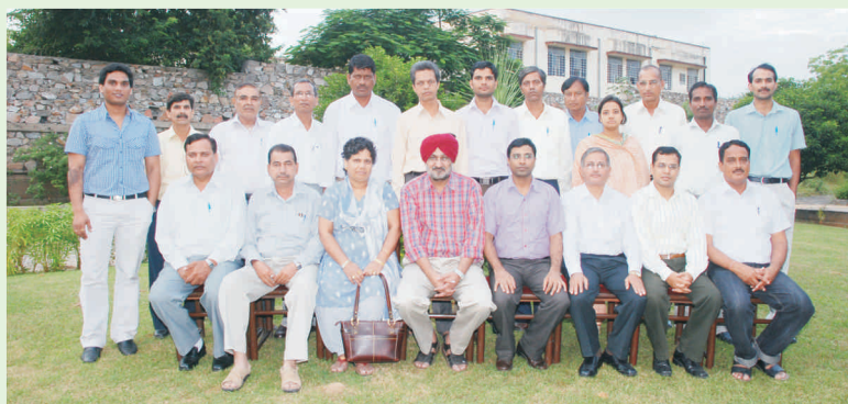
Training on Use of Data for District Level Planning, IDS, Jaipur, Rajasthan 20 - 24 September, 2010

'Training of District Level Officers (TDLO)' project is undertaken by the International Institute for Population Sciences and is funded by the UNFPA. The main objective of the project is to train the district level officers on the use of demographic data for district level planning and development.