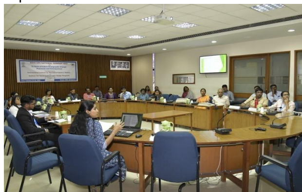
A glimpse of a technical session