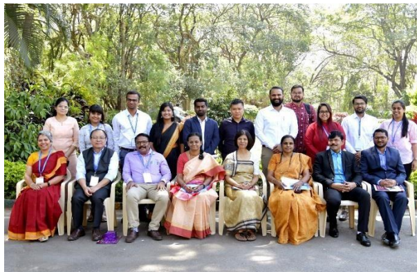
Coordinators, Secretariat Team and Volunteers of the IIPS National Seminar 2023