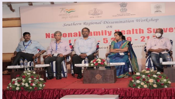
Workshop at Thiruvananthapuram, Kerala, on 27th May, 2022