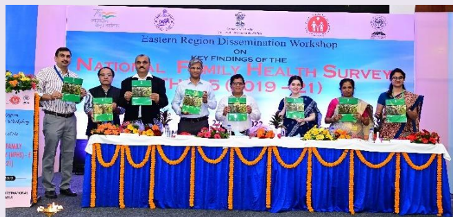
Dissemination for the Eastern region was organized at Bhubaneswar, Odisha