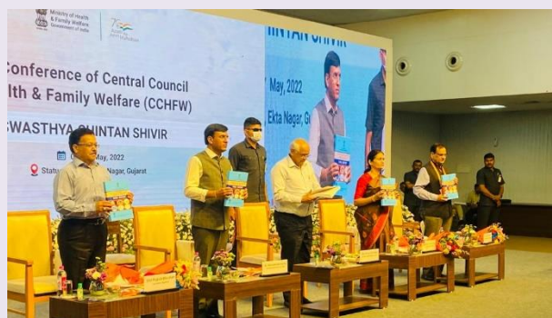
Release of NFHS-5 National Report by Union Minister Dr. Mansukh Mandaviya

As part of the Swasthya Chintan Shivir organized by MoHFW in Tent City, Kevadia, Gujarat during 5-7 May, 2022, the NFHS-5 National Report was released by Dr. Mansukh L. Mandaviya, H’ble Union Minister for Health and Family Welfare on 5 May, 2022. Subsequently, IIPS conducted the National Dissemination Workshop in Delhi on 5-6 August, 2022.