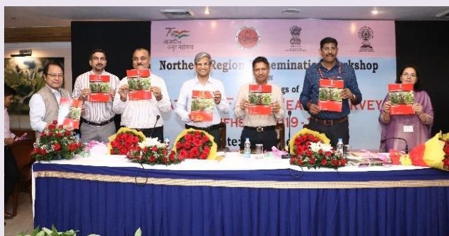
Northern region dissemination was organized at Chandigarh on 28 th June, 2022

The Northern Regional dissemination was organized at Hotel Mount View, Chandigarh on 28 th June, 2022