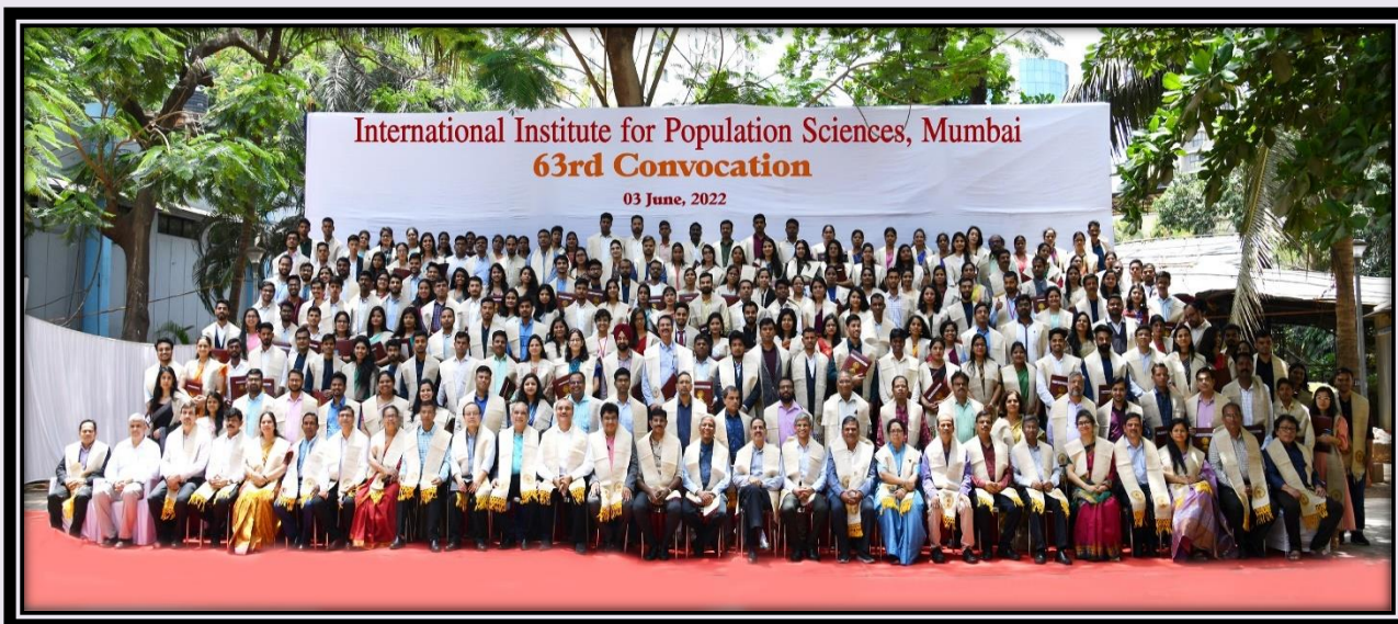
63 rd Convocation of IIPS