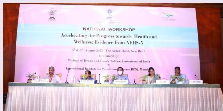
Two-day national dissemination workshop on NFHS-5 findings on 5 th and 6 th August 2022 at New Delhi