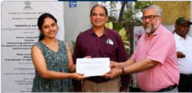
1 ST PRIZE (STUDENTS)