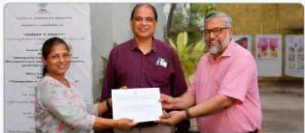
2 ND PRIZE (STAFF)