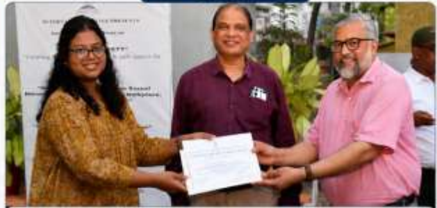
2 ND PRIZE (STUDENTS)