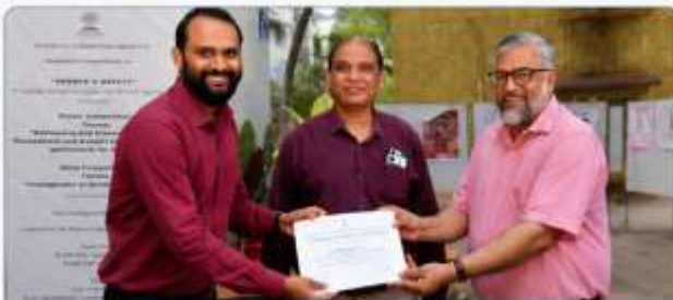
1 ST PRIZE (STAFF)