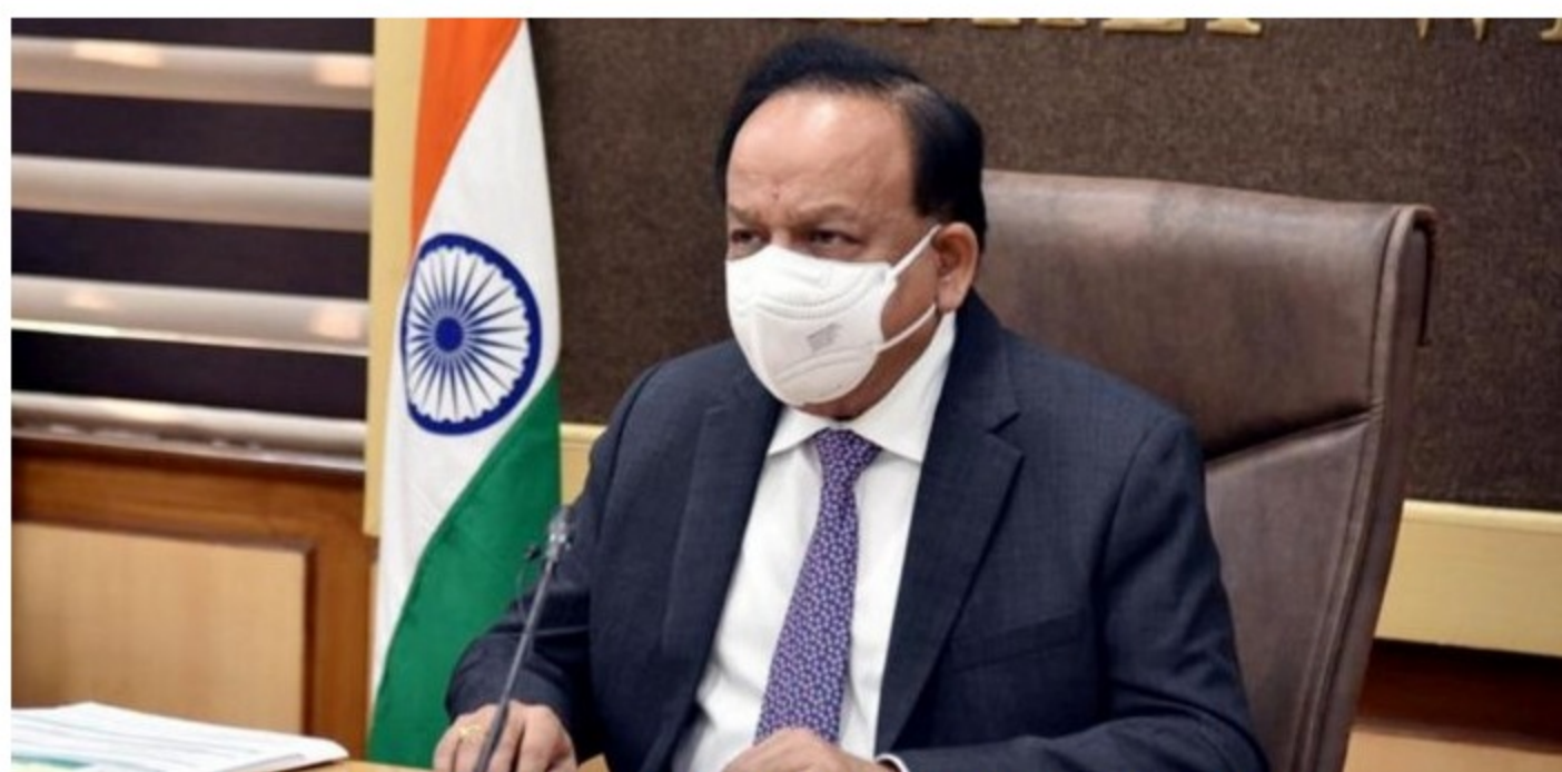
The LASI Wave 1 field survey was released by Health Minister Harsh Vardhan.

PTI, New Delhi, JAN 06 2021, 23:25 IST | UPDATED: JAN 06 2021, 23:29 IST