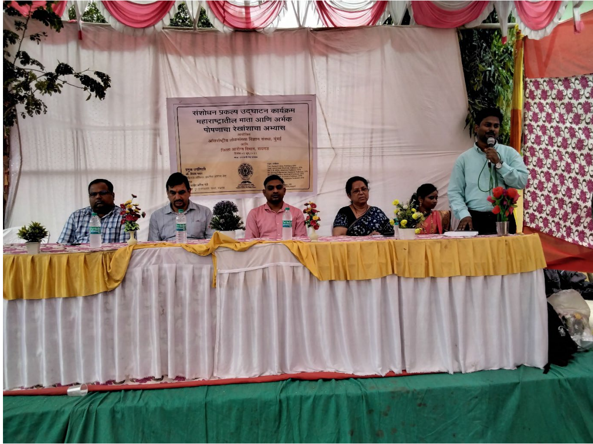
Field Visit of IIPS