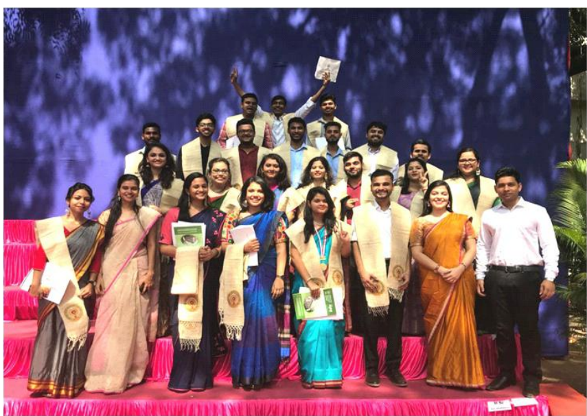
MA/MSc Students: 2015-17